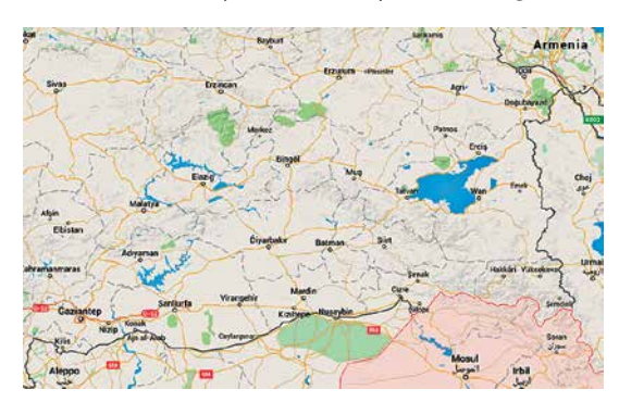
Figure 1. Van city localization

We retrospectively analysed the data obtained from 3352 consecutive patients with HBV infection who were referred to our institution between 2012 and 2014. Of these patients, 2133 were male and 1219 were female. Patients were included in this study if information on hepatitis B serology, HBV-DNA, HDV-RNA, anti-HDV IgG, HBe antigen and liver transaminases was available within the 30 days of the first documented visit. Due to the significant changes in HBV distribution following the recent earthquake in Van province (Figure 1),